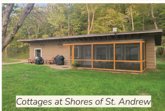
Cottages at Shores of St. Andrew