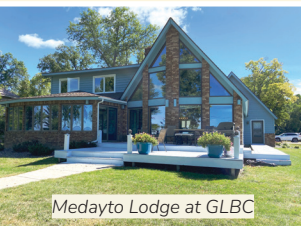
Medayto Lodge at GLBC

Whether you're looking for a small family getaway or to gather a large group, we have a variety of facilities to fit the needs of any kind of group! Contact us or visit GLLM.org to get more information.