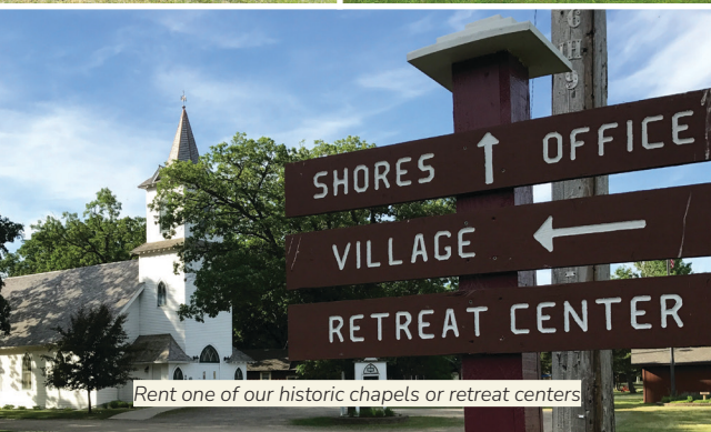
Rent one of our historic chapels or retreat centers

Youth Retreats are a great way to introduce campers to the camp experience!